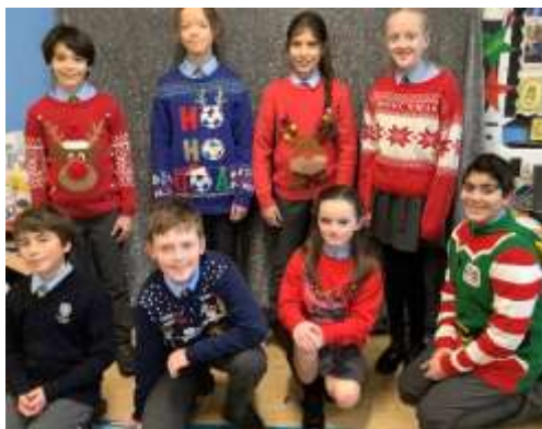
The Chaplaincy Team

We hope that you all have a wonderful Christmas celebrating the birth of Our Lord and Saviour. We look forward to continuing to share God's love with you all in the New Year. Merry Christmas and God Bless you,